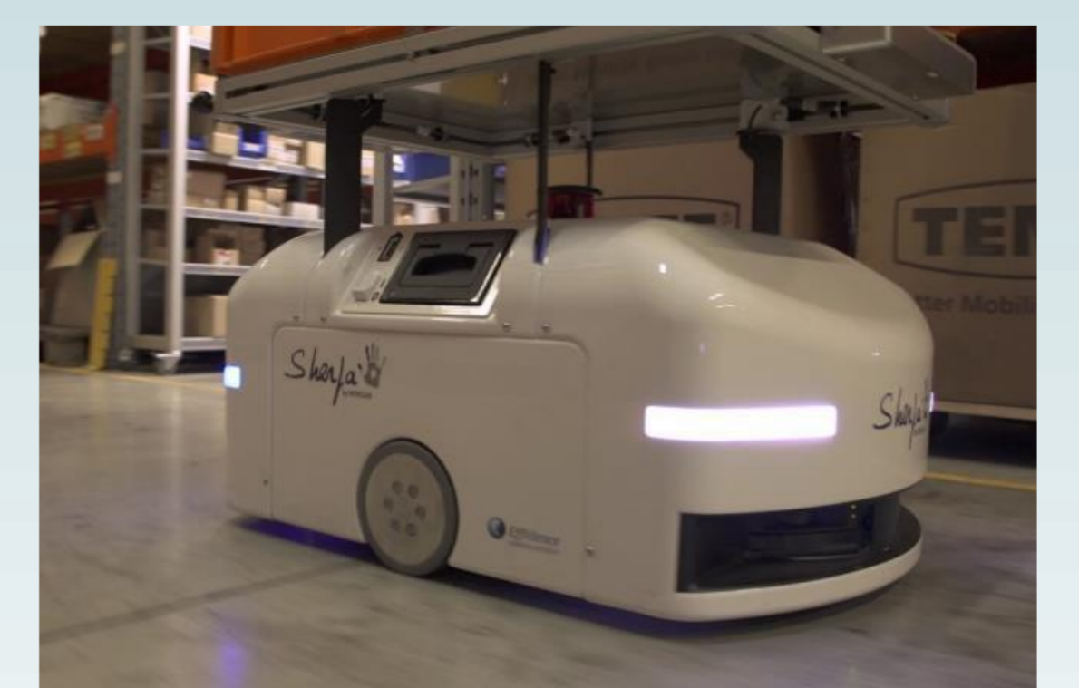
Robot used for experimentation